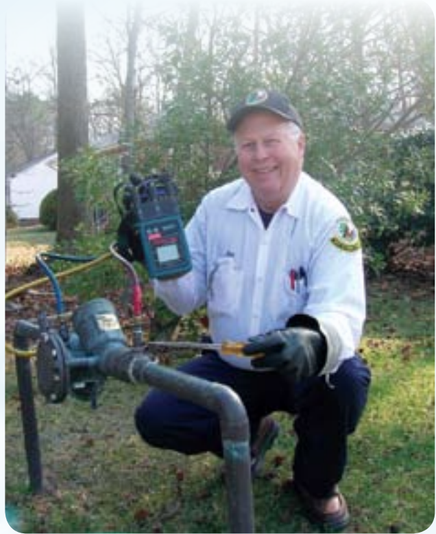
Backflow Technician testing backflow device on irrigation system

If you have any questions, please call our Community Liaison at (804) 501-7540.