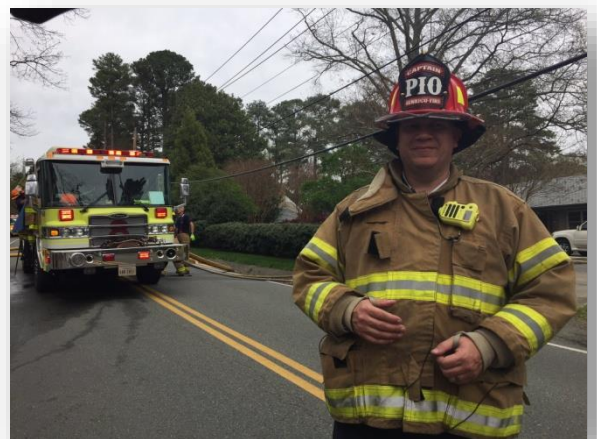
Public Information Officer provides a live interview to local television stations on the scene of a west end house fire.

Community Services also continues to work extensively with print and broadcast media . Our excellent working relationship with the local news outlets allows us to use them to broadcast safety-related public safety announcements, provide interviews, and bring positive exposure to the Division of Fire. This year featured a live-fire demonstration on the dangers of improper grilling on decks and too close to homes, as well as tips on keeping your pets safe in case of fire.