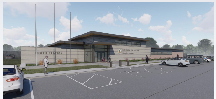
Pictured, above, is an artist's rendering of the new South Station, which should open in early 2025.

On December 5, 2023, South DART and patrol officers worked together to educate motorists on the importance of safe driving. Teams focused their efforts on high crash locations, areas that had received traffic complaints, and Commercial Motor Vehicle enforcement. The initiative's 41 traffic stops resulted in 21 summons and 18 warnings issued, 4 warrants served, and 3 CMV Inspections completed.