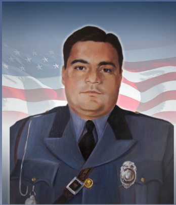
Welford Green December 22, 1948