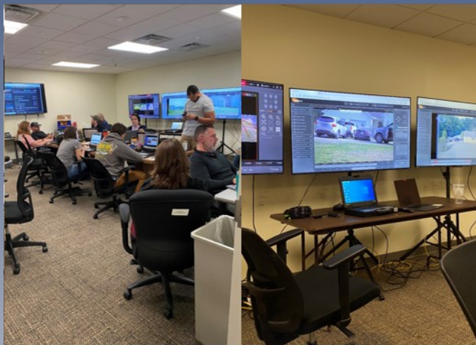
Henrico Detectives and their regional partners interact with offenders on-line in Operation To Catch a Predator.

were charged as a result of this operation.