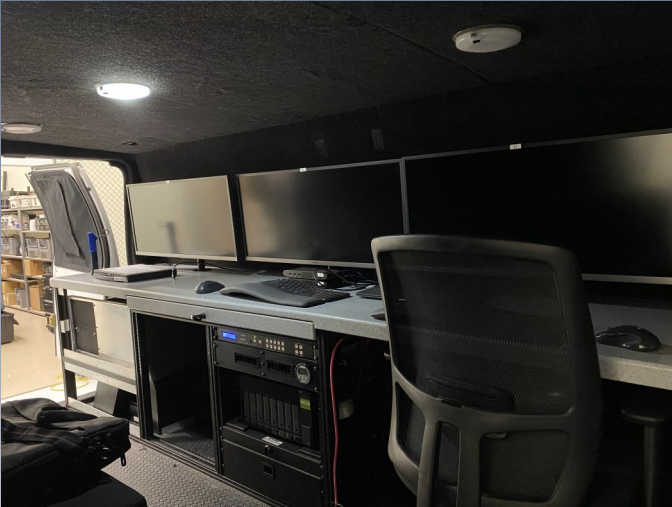
New equipment inside the OCS surveillance van.

can record and stream video from multiple cameras, providing real-time monitoring and information that can be passed along to senior stakeholders during operations.