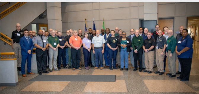
Police Chaplains from across Virginia gathered at the Annual Chaplains Conference on October 27, 2023.

The Division hosted the annual Police Chaplains Conference on October 27, 2023. It provided the