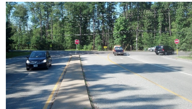
Existing Woodman Road and Greenwood Road Intersection.

Anticipated Cost – Approximately $6,755,000