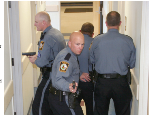
Officers with the Division of Police participate in a drill to sharpen Henrico County's emergency response in the event of an active-shooter situation. Police collaborated with the Division of Fire on the training effort, which allowed the agencies to prepare for a more coordinated response.

The program uses a variety of strategies, including proactive and reactive investigative techniques; apprehending offenders while they are committing a crime; increasing conviction rates and minimizing plea