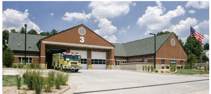
A new Fire Station 3 opened in July at 1310 E. Washington St., near North Airport Drive in eastern Henrico. The 11,160-square-foot, $4.5 million station replaced a smaller, nearby station built in 1956.

The decreases have been dramatic in several neighborhoods, falling from rates as high as 25 percent and