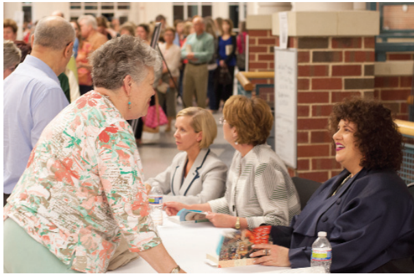
New York Times best-selling author Adriana Trigiani greets a line of fans during All Henrico Reads 2013, organized in April by the Henrico County Public Library. In two appearances, Trigiani spoke about her career path, from playwriting to scriptwriting to author. She also signed books and appeared for photographs.

Henrico County Public Library (HCPL) in September 2012 launched its library services plan, which includes a new mission, vision and goals for the library.