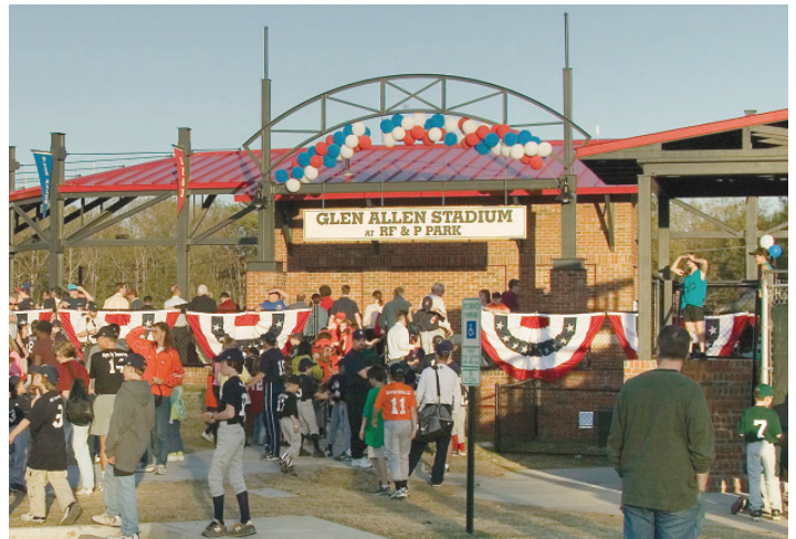
The Division of Recreation and Parks in March launched the Visit Henrico County campaign to promote Henrico as a premier destination for sports, leisure and historical travel. The campaign touts county attractions and facilities, such as Glen Allen Stadium at RF&P Park, as a potential venue for youth baseball tournaments and other recreational sporting events.

The workforce center had a sharp increase in visitation during the first two months at its new location, which is more central to the region and accessible from the GRTC Transit System.