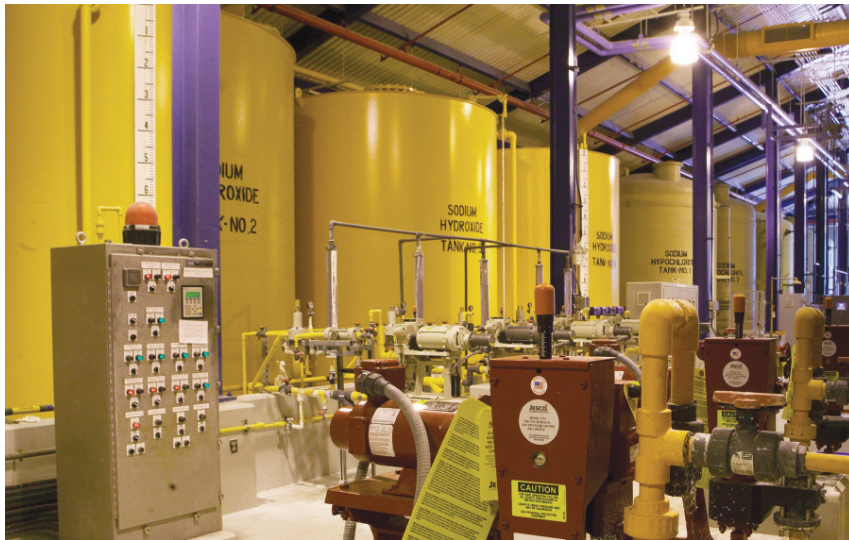
The Department of Public Utilities has installed Jesco pumps to boost the capacity of the Water Treatment Plant's primary coagulant system, which combines and settles particles before filtration. The pumps are part of an $8.7 million project to increase the plant's capacity to 80 million gallons per day, up from 55 million gallons.

The Juvenile and Domestic Relations District Court Service Unit, also known as Juvenile Probation, established an orientation program