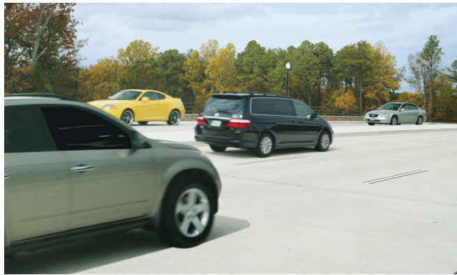
A 2.1-mile extension of North Gayton Road opened in October, providing another access to Henrico's northwestern area. The $48 million project, managed by the Department of Public Works, extended North Gayton northward from West Broad Street before connecting to Shady Grove Road at Pouncey Tract Road.

To accommodate the additional deputy clerks and to better serve customers, the court remodeled its offices to provide two service windows for the public in the traffic and criminal