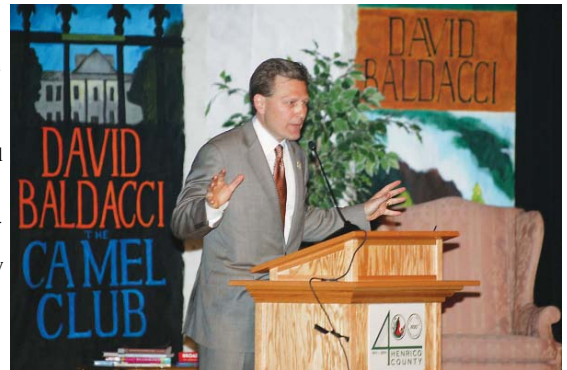
The 2011 "All Henrico Reads" event honored David Baldacci, the acclaimed author of 19 best-selling novels and a graduate of Henrico High School. Baldacci presented to more than 2,000 middle and high school students and also addressed a capacity crowd of 1,300 fans at Glen Allen High School.

The dynamic, complex system — AVLS tracks some 700,000 GPS locations from Police and Fire vehicles each day, in addition to the other input it manages —