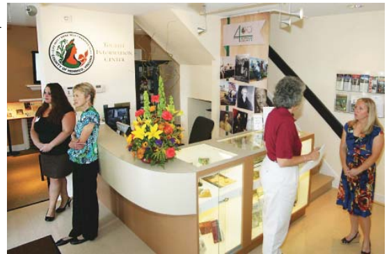
To help promote its 400th anniversary and the variety of county attractions, Henrico opened its first Tourist Information Center in FY 11. Located in historic Dabbs House, the facility is one of 61 certified visitor centers in the commonwealth.

The Commonwealth's Attorney's Office and its more than 50 staff members prosecute perpetrators of violent crime and pursue narcotics traffickers through the use of two multi-jurisdictional juries. The office works to enforce Virginia Exile laws and makes special efforts to reduce domestic violence. Cases are tried in the Circuit, General District and Juvenile and Domestic Relations courts.