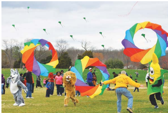
The 2011 Kite Festival attracted a record crowd of more than 24,000 kite aficionados to Dorey Park. The event was one of many held to celebrate Henrico's 400th anniversary.

The extensive investigation took more than a year, required tracking pa-