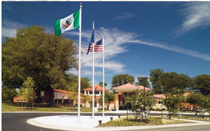
The Glen Allen Branch Library doubled in size following an $8.3 million renovation in FY 11. The library is the first general government facility to seek Leadership in Energy and Environmental Design (LEED) certification.

over documents from a range of print and online sources before editing and compiling it into a comprehensive resource. The Notable Henricoans Database was made available on the official 400 th anniversary website, www.henrico400th.com , as well as the HCPL website, www.henricolibrary.org ; it will remain as a resource on the library site once the anniversary ends. The database received a 2011 Achievement Award from the National Association of Counties.