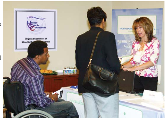
Henrico's continuing efforts to reach out to small, women- and minority-owned companies — including the annual Henrico County Connections business fair, pictured here — won the Best New Public Program award from the Virginia Minority Supplier Development Council in FY 11.

Juvenile Probation teamed with other county agencies to host the eighth annual Stepping Stones awards ceremony in FY 11.