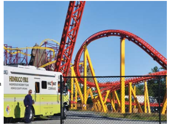
Henrico Fire coordinated HENEX 2010, a multi-jurisdictional training exercise that simulated a large-scale mass casualty incident at King's Dominion. Nearly 330 emergency responders and other personnel from 14 central Virginia agencies participated in the two-day event.

Building Construction and Inspections staff conducted 51,351 site inspections in FY 11, examining plumbing, electrical, mechanical and other aspects of new construction, and issued 12,208 permits valued at nearly $387 million. The inspection and permit numbers largely were unchanged from the previous