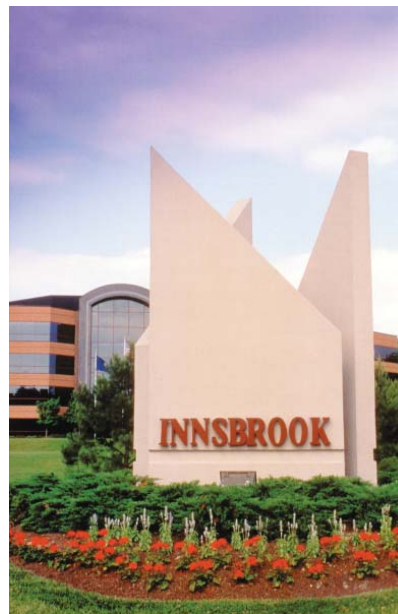
Henrico County added close to 2,200 new jobs in FY 11, and more than half of them were located in the Innsbrook Corporate Center. Major corporations General Electric and Capital One Financial are among Innsbrook's new tenants.

MH/DS helped a large number of residents maintain safe and secure housing in FY 11 through its administration of the Housing Choice program. Funded through federal and state agencies, the income-based