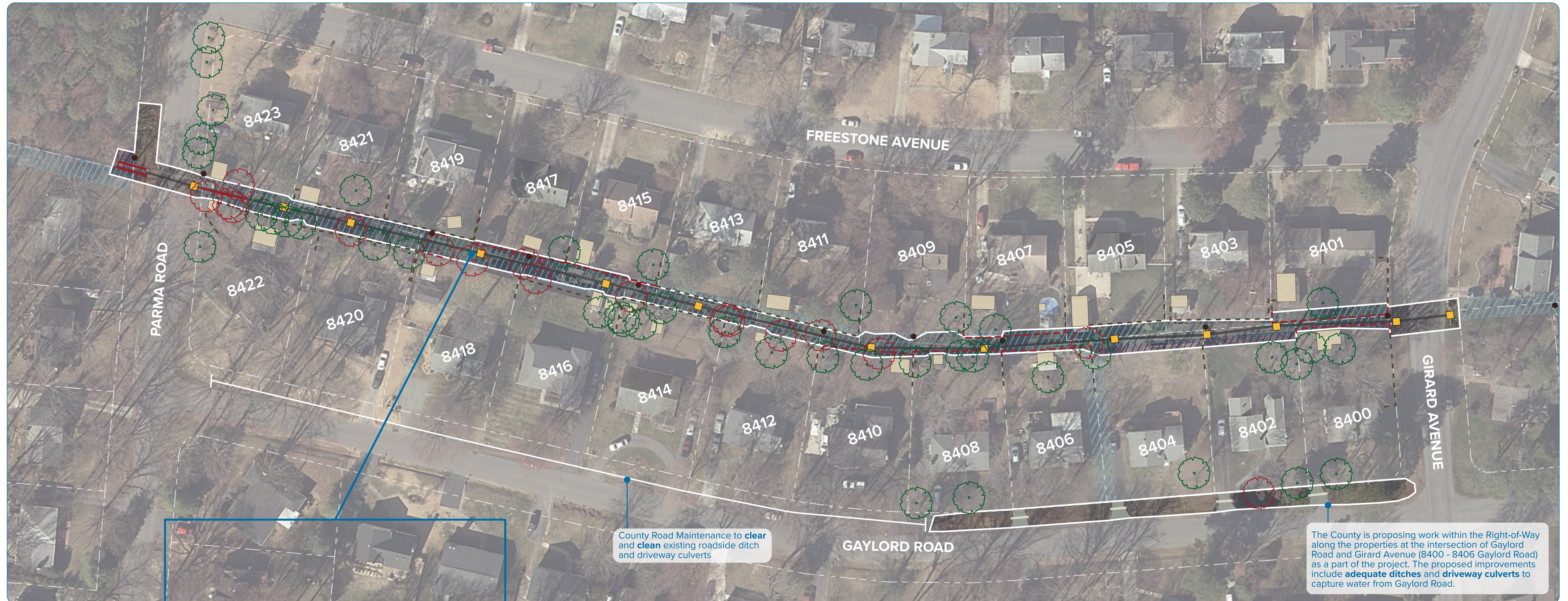
Before Proposed Improvements