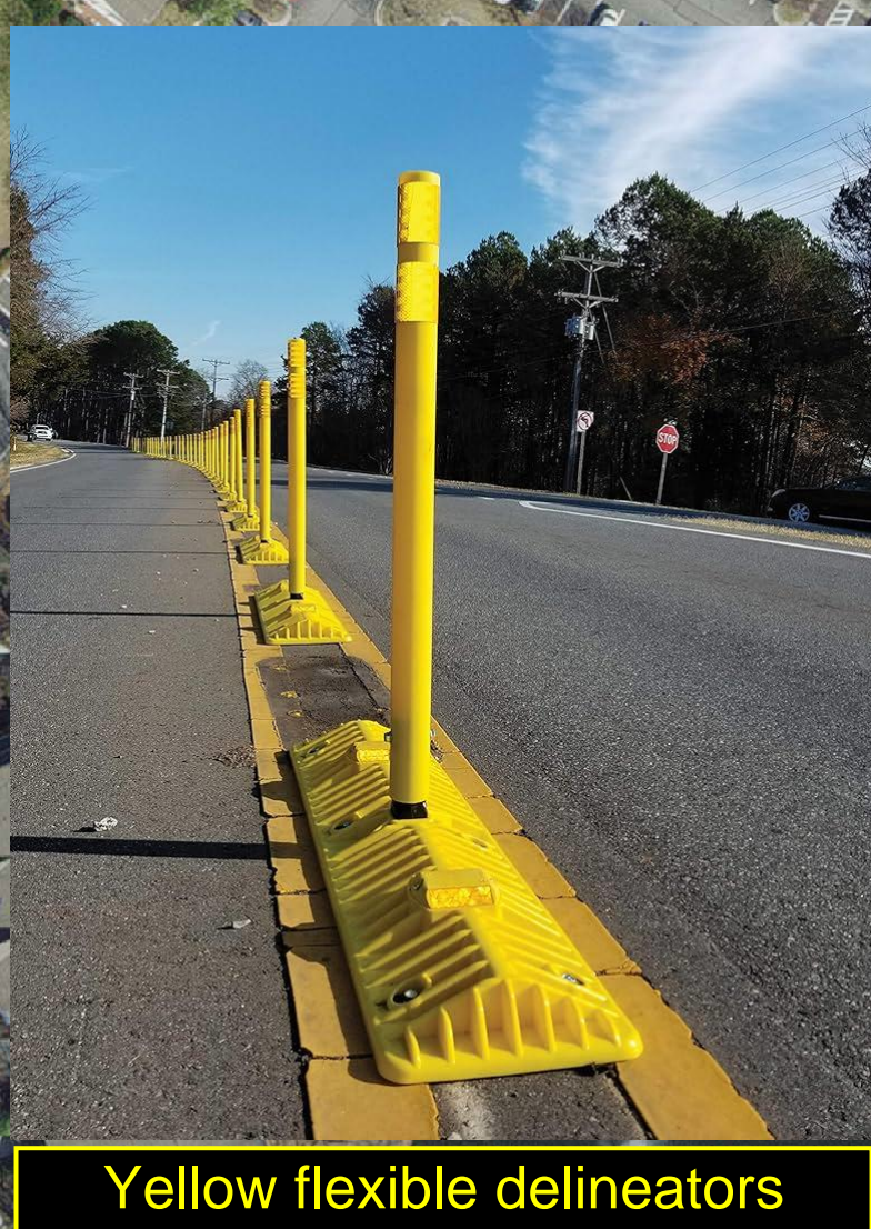
Yellow flexible delineators