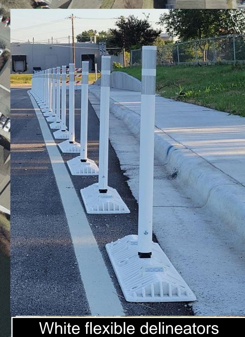
White flexible delineators