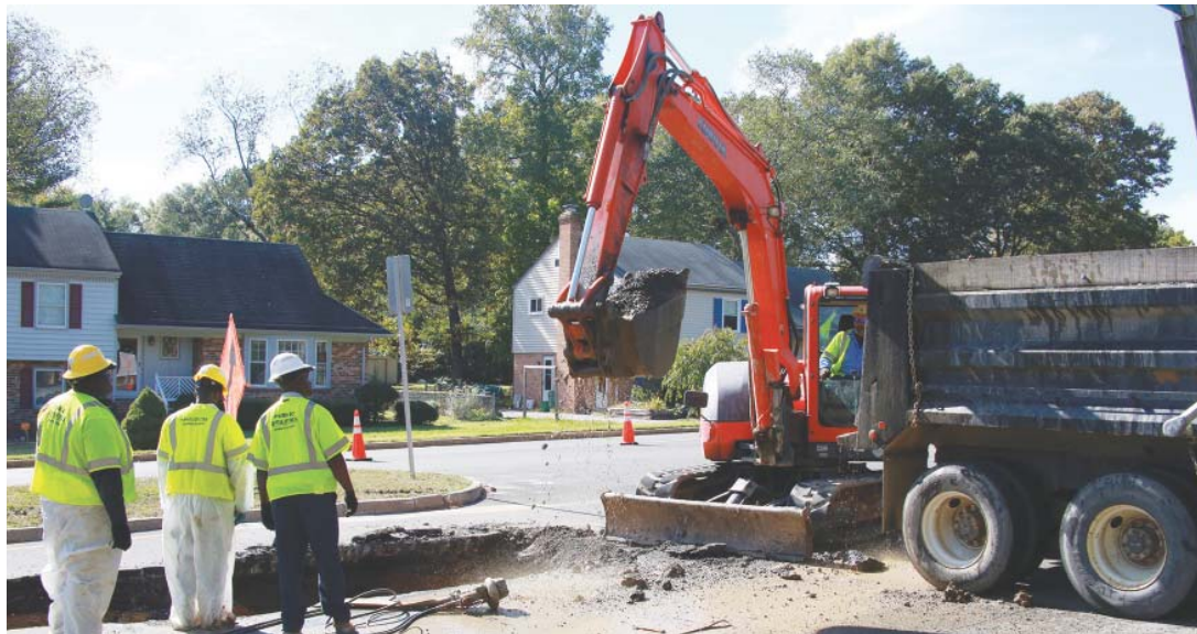
Crews with the Department of Public Utilities excavate the area of the water main break on Lauderdale. With each break, the county strives to fix the problem as soon as possible while minimizing any disruption of water service for customers and inconvenience for motorists.

In addition to a pipe’s age, fluctuations between freezing and unfreezing temperatures can increase the likelihood of a break,