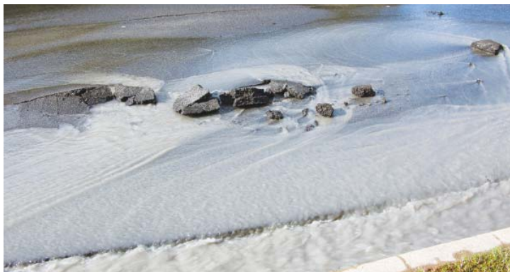
Water flowing from the broken 8-inch main on Lauderdale caused a section of pavement to bubble and crumble.

East Clinic is open 8 a.m. to 4:30 p.m. Monday through Friday. For more information call (804) 652-3190 or go to henrico.us/health .