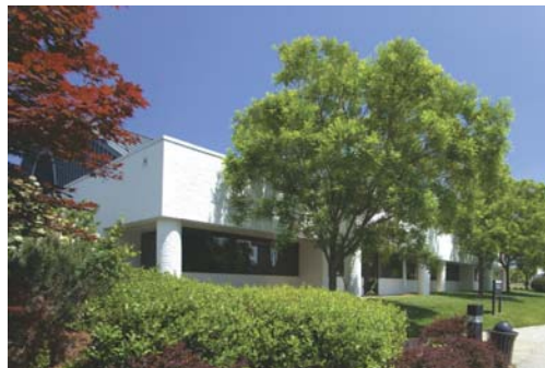
Eastern Government Center 3820 Nine Mile Road 652-3600