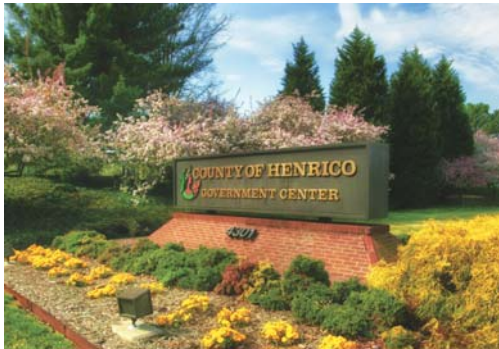
Government Center 4301 East Parham Road 501-4000