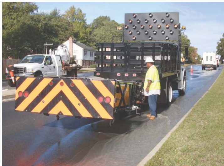
A morning water main break on Lauderdale Drive forced crews to re-direct travel between Lochwood and Cambridge drives while repairs were made to the line and then the road.