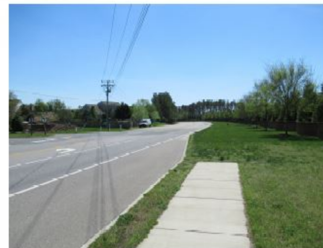
Pouncey Tract Road @ Kaechele Elementary School