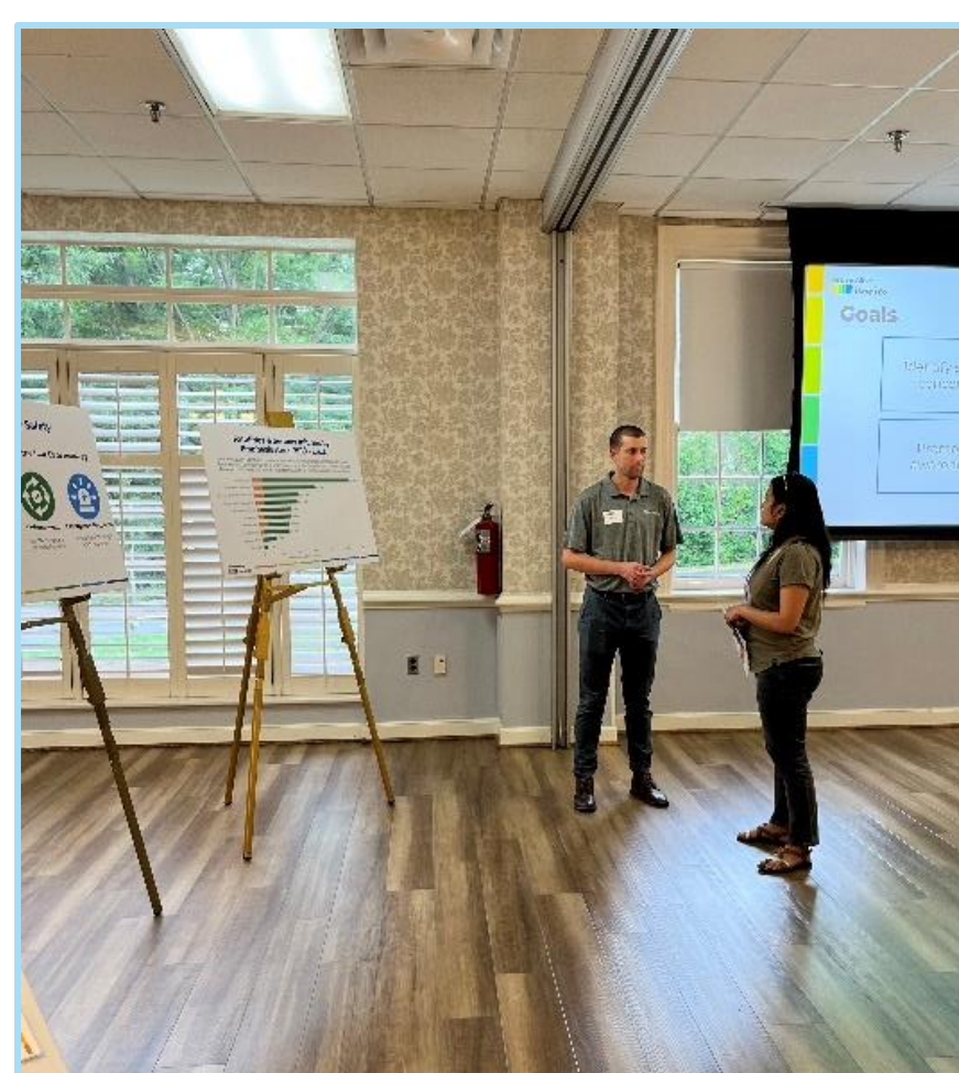
Belmont Recreation Center