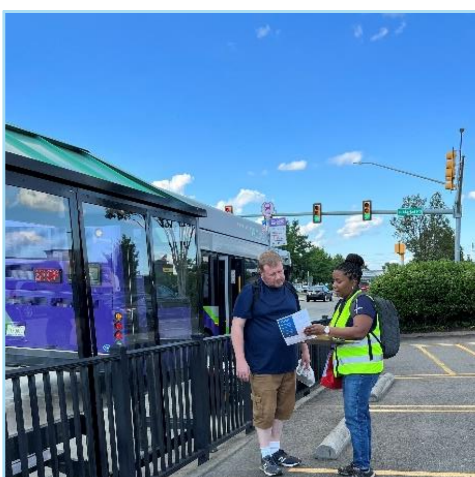
Willow Lawn Drive Bus Stop