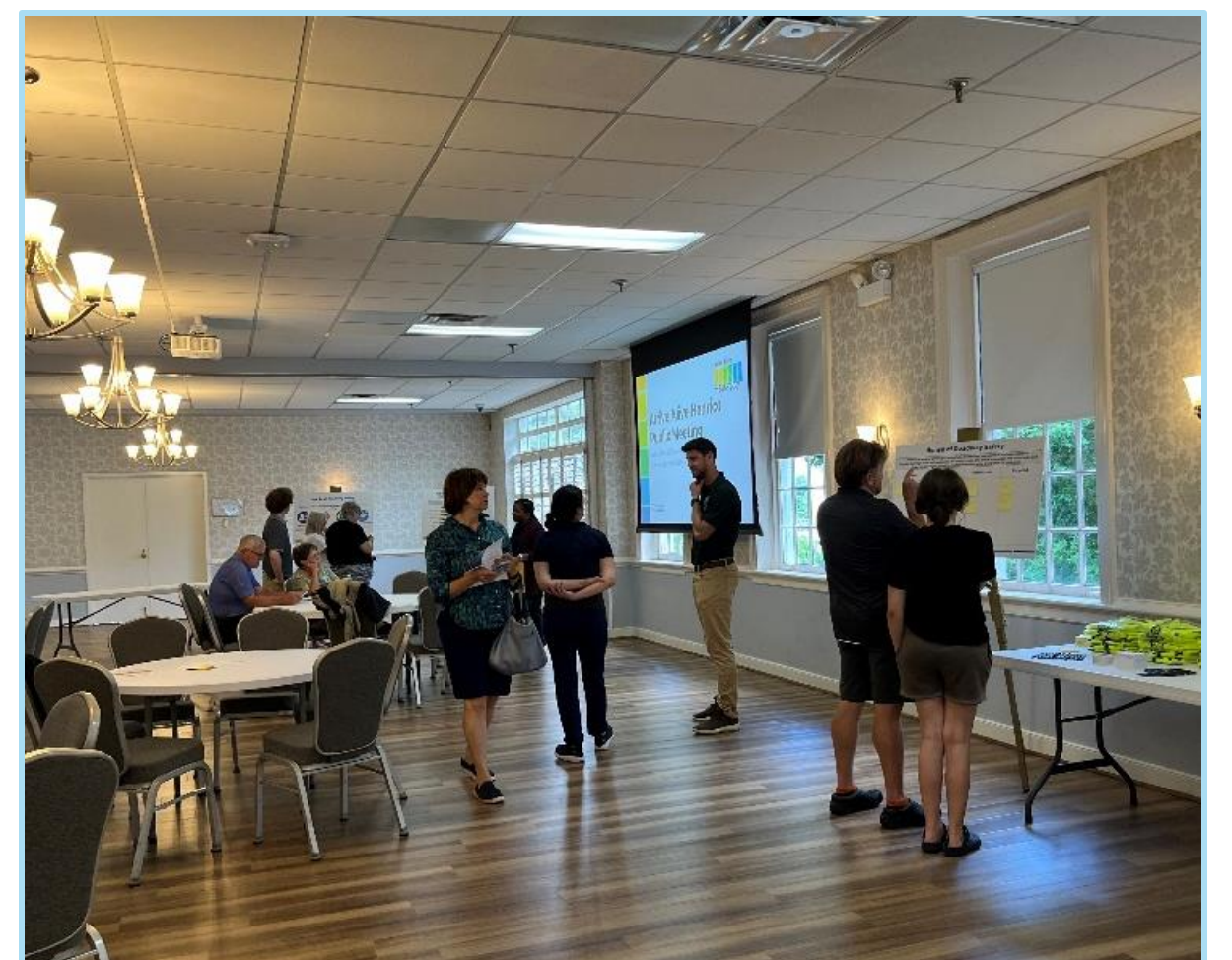
Belmont Recreation Center